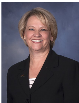
Mayor Debbie Winn

Calendar of Events, Get Text and/or Email Notifications from Tooele City Page 8